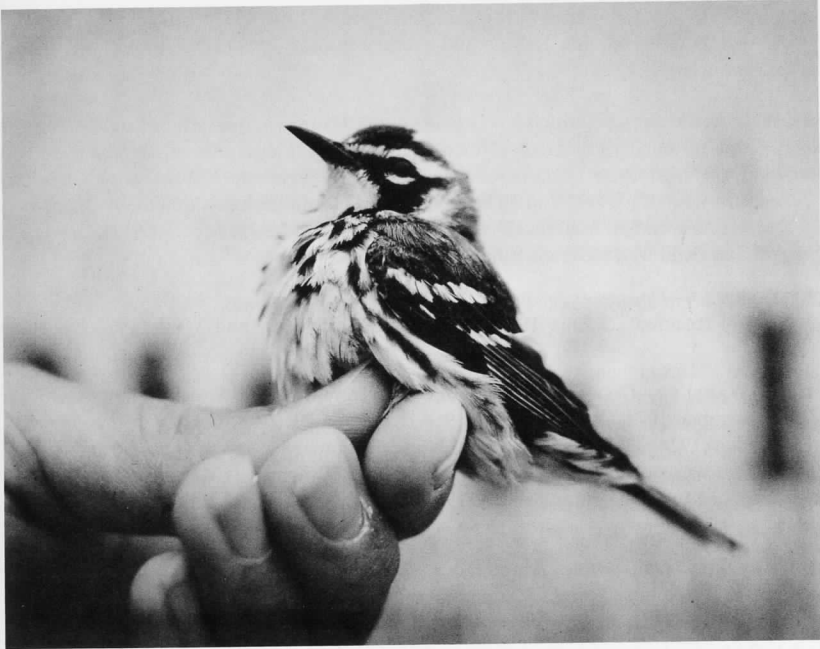
FIGURE 2. The adult Yellow-throated Warbler captured and banded on Southeast Farallon Island 8 July 1969. First California occurrence.

1975 and 25 June and 1 July 1968. Tenaza (1967) collected four in June and July 1965, the latest being one on 3 July 1965.